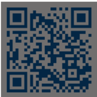
Softball Tryout Registration