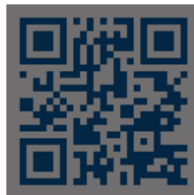
Rank One App