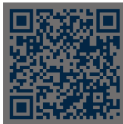
Norcross Softball Instagram