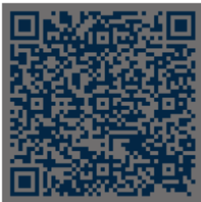
Gwinnett County Sports Physical Form